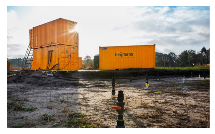
Figure 2. Injection Well Manifold