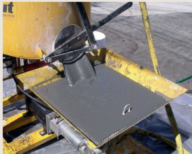
EHC® Slurry for DPT Injection