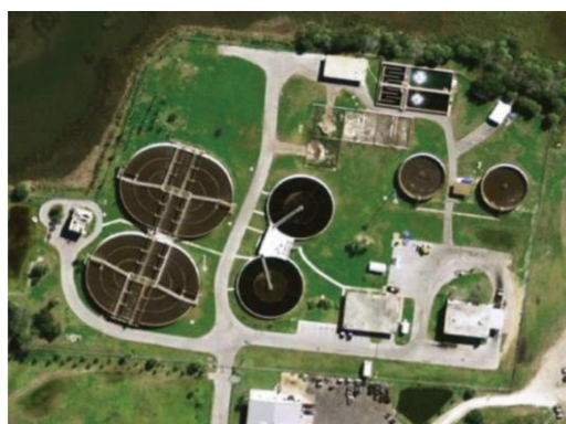
Figure 1: St. Augustine Wastewater Treatment Plant

The 2.7 million-gallon-per-day (MGD) wastewater treatment plant in St. Augustine has a chlorination/dechlorination disinfection system, but plant officials decided to seek an alternative disinfection process that did not generate DBPs, was cost effective, and was simple to operate. The plant investigated disinfection options such as ozone and ultraviolet disinfection, but VIGOROX® WWT II disinfection was deemed the most attractive option because the plant's existing contact chamber could be used for the VIGOROX® WWT II technology, providing large capital cost savings to the municipality.