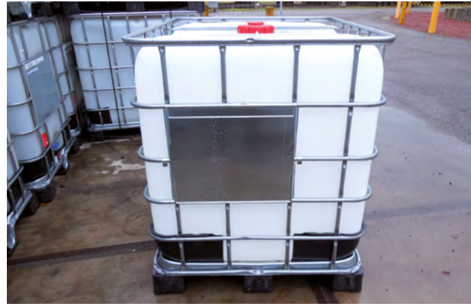
ISO container – 24 t IBC – 1,100–1,150 kg