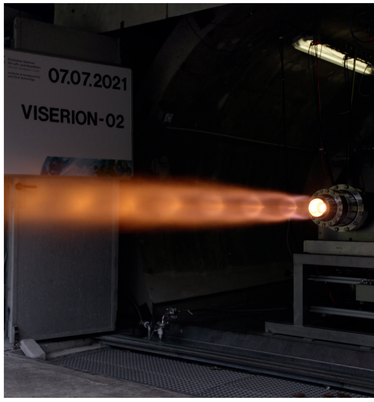
The German Aerospace Center (Deutsche Zentrum für Luft- und Raumfahrt, DLR) successfully tests the VISERION hybrid rocket engine using Evonik's highly concentrated hydrogen peroxide, PROPULSE<sup>®</sup>.